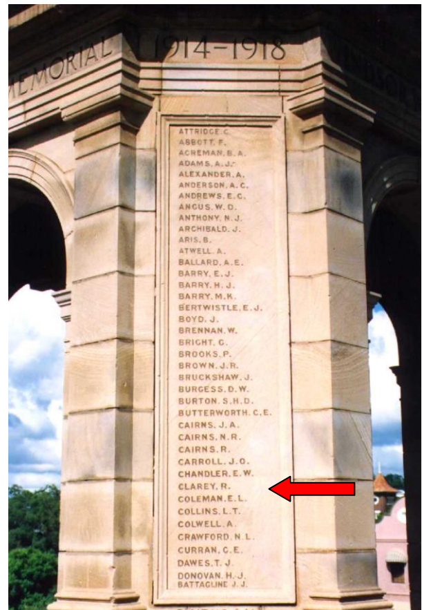
Windsor War Memorial